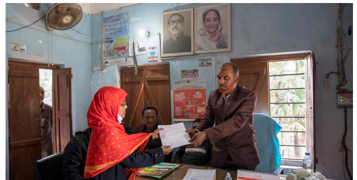
Advocating for climate resilient infrastructures

Recognizing that the climate crisis we face today is a failure of global governance, our actions are aimed at creating a space for those most vulnerable to be at decision-making bodies and platforms at different levels. This is based on the principle of "nothing about us, without us." We support rights holders to gain confidence and have the evidence to effectively claim their rights and build capacities of duty bearers to deliver on their commitments. We strengthen accountability mechanisms, both upwards and downwards.