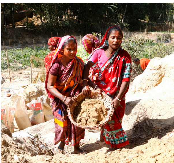
Community road rehabilitation