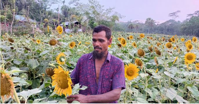
Adapting agricultural practices